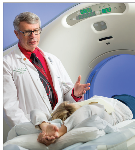
Lung cancer screening with low-dose CT is fast and takes only a few minutes to complete

Major medical societies recommend that lung cancer screening be done at medical centers with access to multi-disciplinary lung cancer diagnosis and treatment programs. Since the first scan can lead to additional testing, find a center that has the ability to interpret and respond to your results. Sometimes lung cancer screening identifies other things not related to lung cancer that may require follow up.