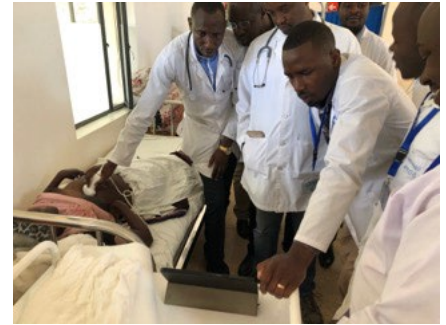
Doctors at Butaro Cancer Center of Excellence (BCCOE) in Butaro, Rwanda, being trained in bedside ultrasound.

Our determined approach prioritizes evidence-based solutions that can be applied in real-world settings. DCC's nimble interdisciplinary group maximizes opportunities and leverages contacts. In 2020, we founded the Global Oncology Disparities of Care monthly symposium, which continues to meet monthly on Zoom. In the next three years, we are poised to make substantial contributions to optimizing adherence to cervical cancer surveillance recommendations in women with HIV and testing innovative biomarkers to optimize appropriate treatments for advanced breast cancer. Student programs are advancing research and scientific knowledge of genotypes and other cervical cancer biomarkers in Honduras. The Arctic, Peru, and Haiti are other sites with strong Dartmouth connections.